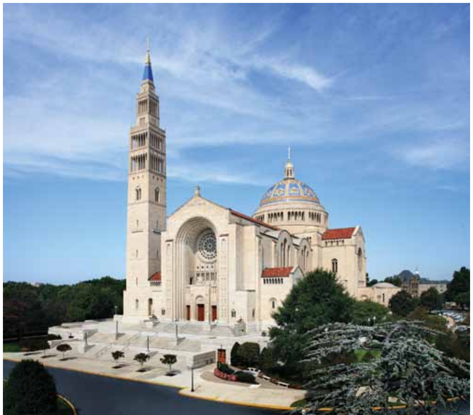
The Basilica of the National Shrine of the Immaculate Conception

The escorted three-day, two-night tour will take place from June 17-19. It includes deluxe motor coach service with Lakefront Lines and two nights of hotel accommodations at the Comfort Inn of Falls Church, Va. The trip will include a guided tour and dinner at Mt. Vernon, George Washington's estate; breakfast in the hotel both mornings; Mass and a tour at the National Shrine with a box lunch; a four-hour tour of Washington, D.C. with a local, step-on-guide; a Buffet dinner at Phillips Waterfront Restaurant; and a tour of the Franciscan Monastery before the participants head home on Saturday.