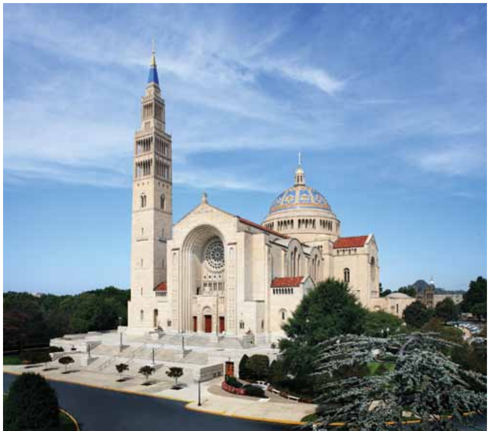
The Basilica of the National Shrine of the Immaculate Conception

The escorted three-day, two-night tour will take place from June 17-19. It includes deluxe motor coach service with Lakefront Lines and two nights of hotel accommodations at the Comfort Inn of Falls Church, Va. The trip will include a guided tour and dinner at Mt. Vernon, George Washington's estate; breakfast in the hotel both mornings; Mass and a tour at the National Shrine with a box lunch; a four-hour tour of Washington, D.C. with a local, step-on-guide; a Buffet dinner at Phillips Waterfront Restaurant; and a tour of the Franciscan Monastery before the participants head home on Saturday.