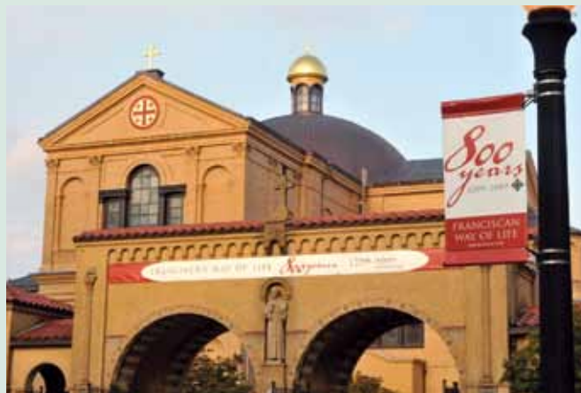
The Franciscan Monastery of the Holy Land in America

The price of the Washington, D.C. tour is $299 per person, based on double occupancy. Please call the Immaculate Conception rectory at 440-942-4500 to make reservations, or for more information.